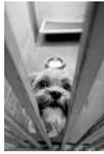
The animal euthanasia rate for County Animal Services is much lower than the national average, the Humane Society of the United States reports.

The Humane Society study is a good first step in healing the rift. We urge the county to follow through by appointing a task force, developing a plan of action and implementing it as expeditiously as possible.